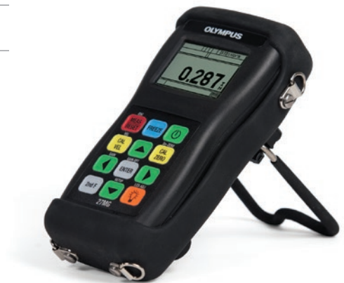
27MG with the optional Protective Rubber Boot with Neck Strap and Gage Stand

For additional accessories such as holders, wands, and couplants, please consult Olympus.